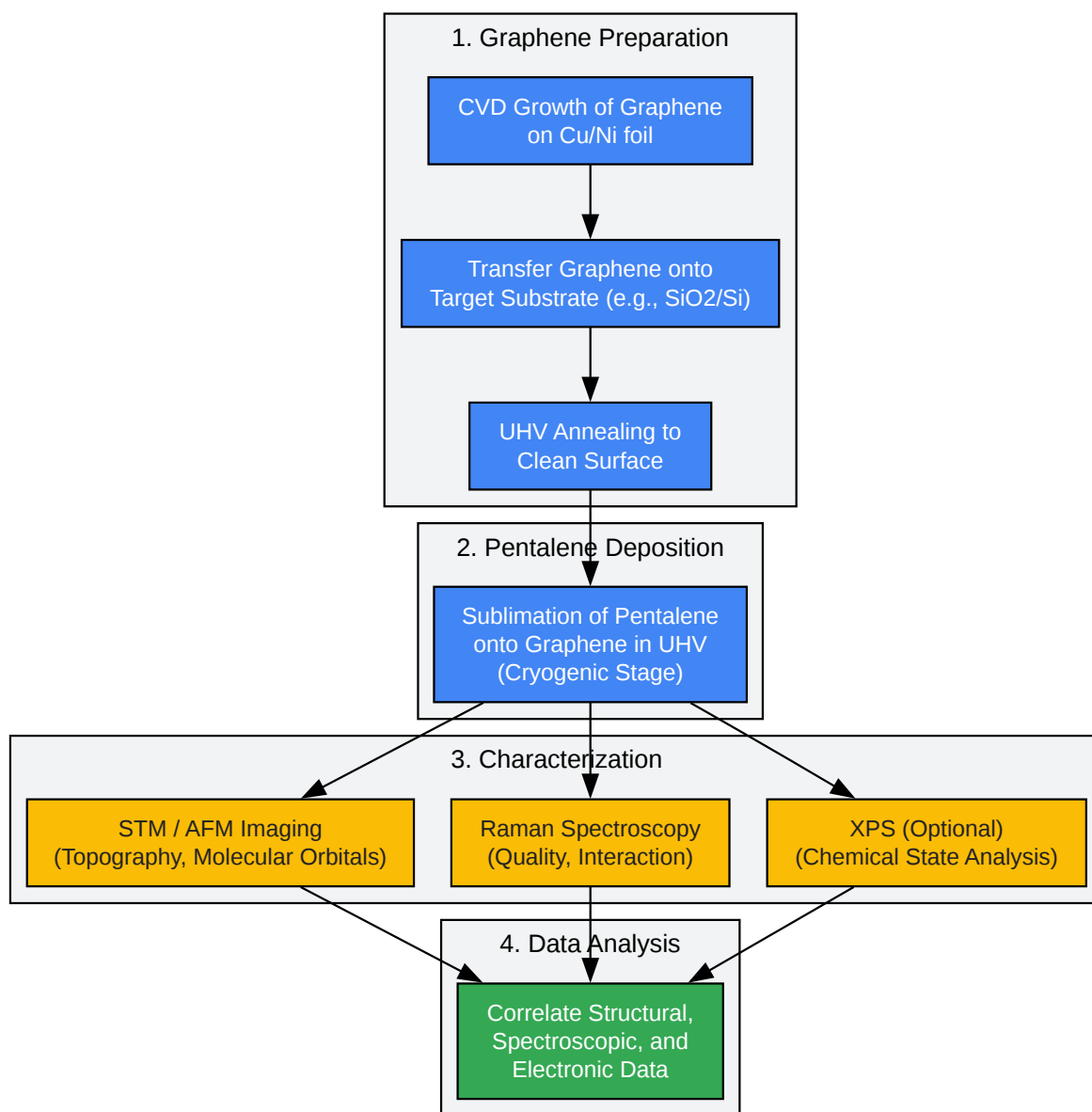
General Experimental Workflow

A typical experimental workflow for studying pentalene -graphene interactions involves sample preparation, deposition, and multi-modal characterization.