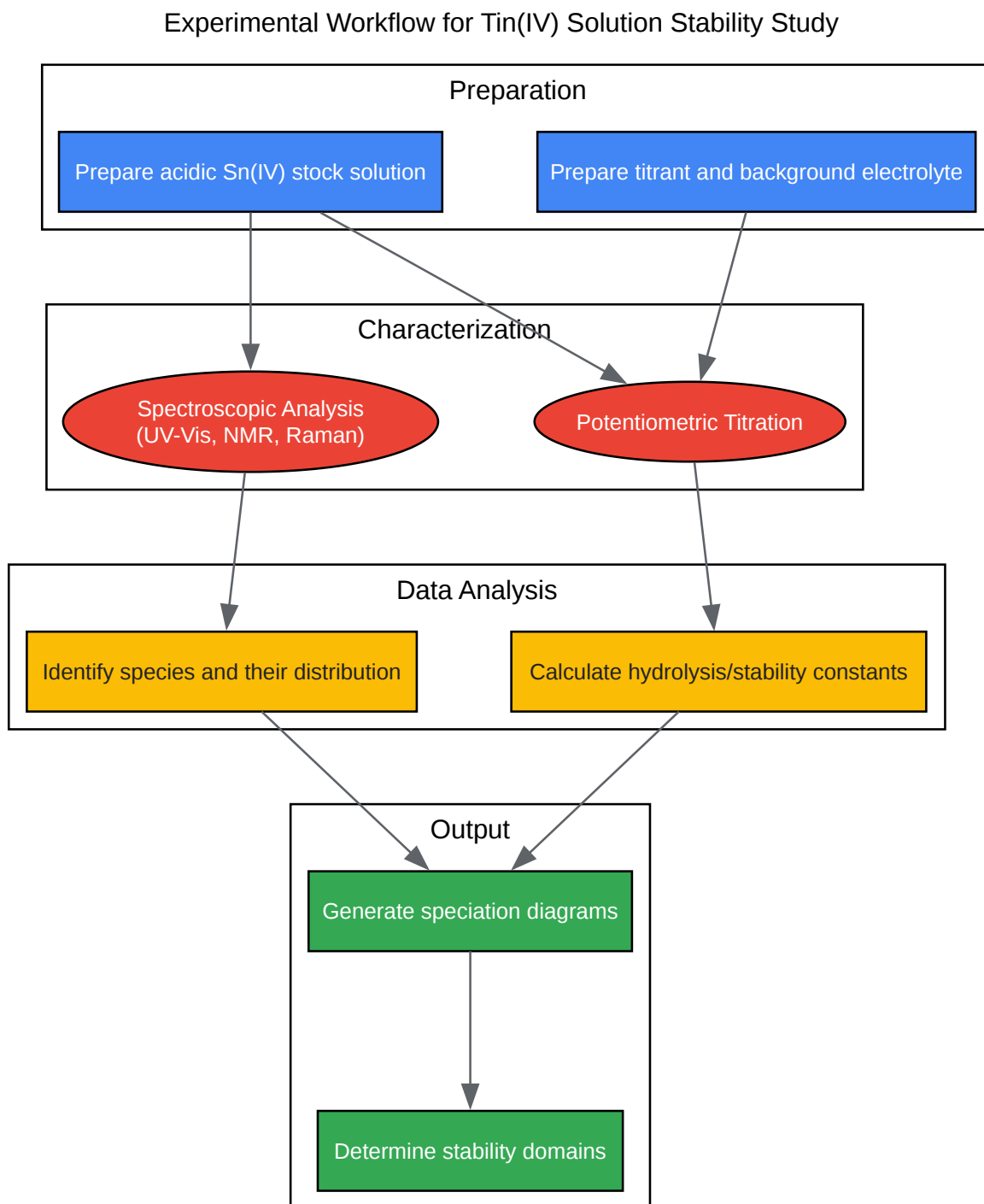
Caption: Hydrolysis and polymerization pathway of tin(IV) in aqueous solution.

Click to download full resolution via product page