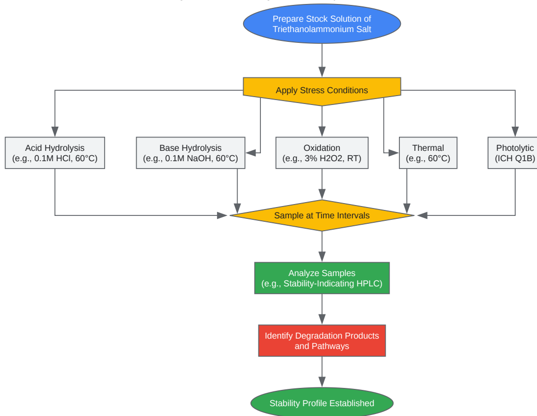
Diagram 2: Forced Degradation Study Workflow

Click to download full resolution via product page