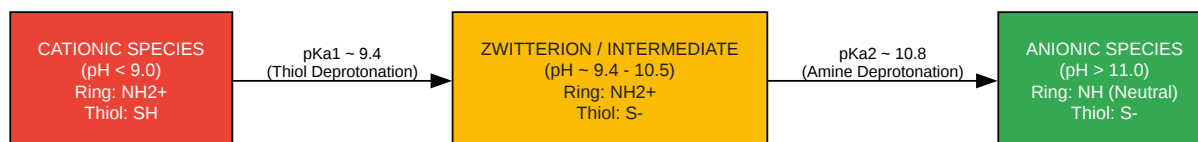
Figure 1: Predicted ionization pathway. The thiol deprotonates first due to the inductive effect of the azetidinium ring.

The following diagram illustrates the sequential deprotonation pathway of (Azetidin-3-yl)methanethiol .