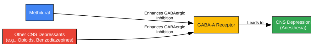
Figure 1: Additive effect of Methitural and other CNS depressants at the GABA-A receptor.

Click to download full resolution via product page