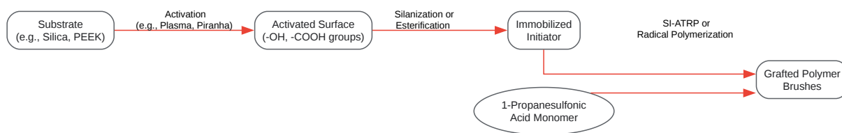
Diagram: "Grafting From" Workflow

Click to download full resolution via product page