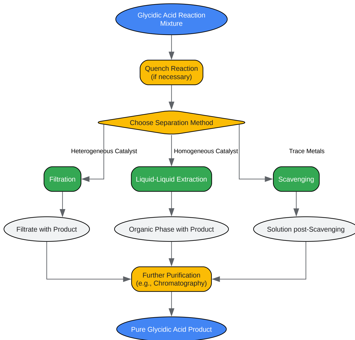
Caption: Troubleshooting workflow for catalyst removal.

Click to download full resolution via product page