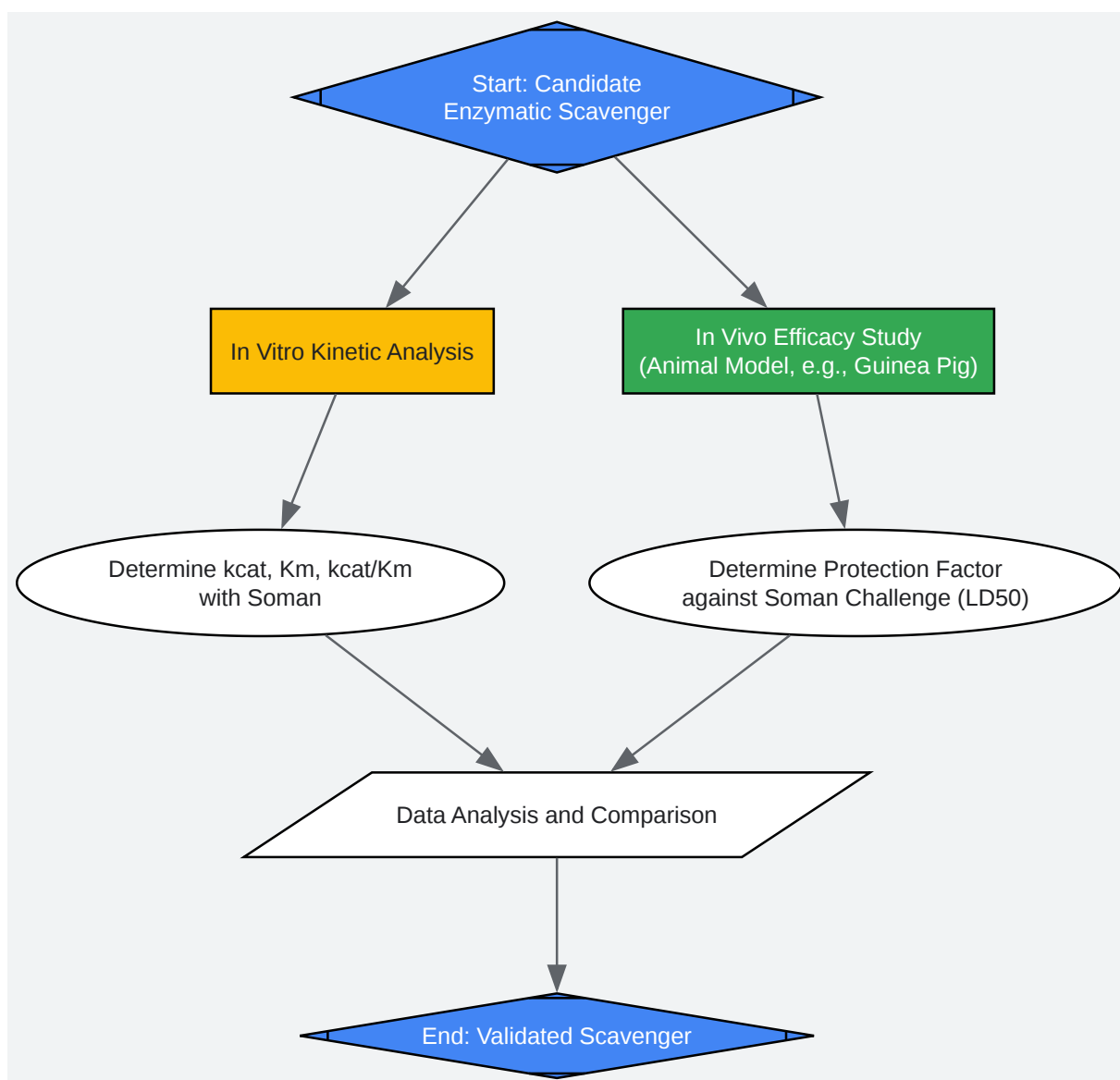
Figure 2. Soman Detoxification by Enzymatic Scavengers.

Click to download full resolution via product page