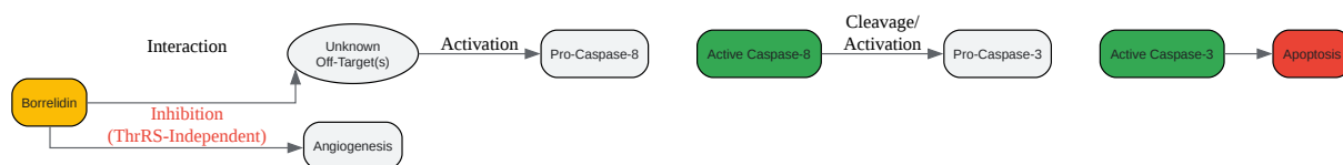
Diagram 1: Borrelidin's On-Target Signaling Pathway.

Click to download full resolution via product page