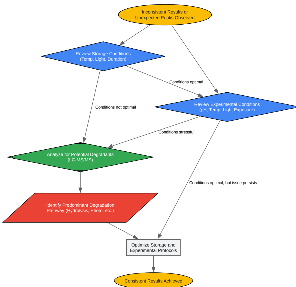
Caption: Hypothesized degradation pathways of Fluocufuron .

Click to download full resolution via product page