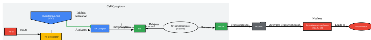
Diagram 1: Proposed Anti-inflammatory Signaling Pathway of Hypochlorous Acid in Corneal Epithelial Cells

Click to download full resolution via product page