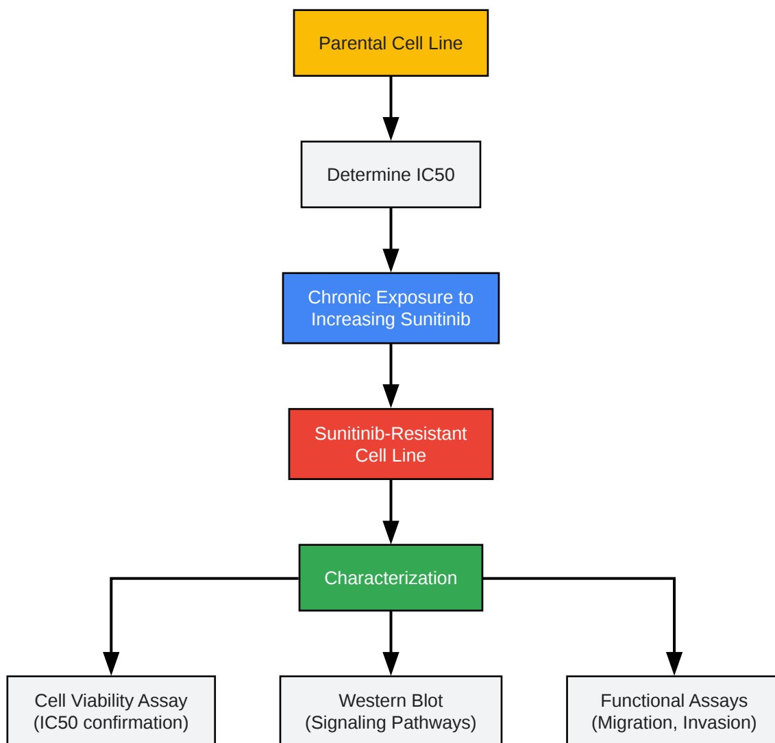
Diagram 2: Experimental Workflow for Developing and Characterizing Sunitinib-Resistant Cells

Click to download full resolution via product page