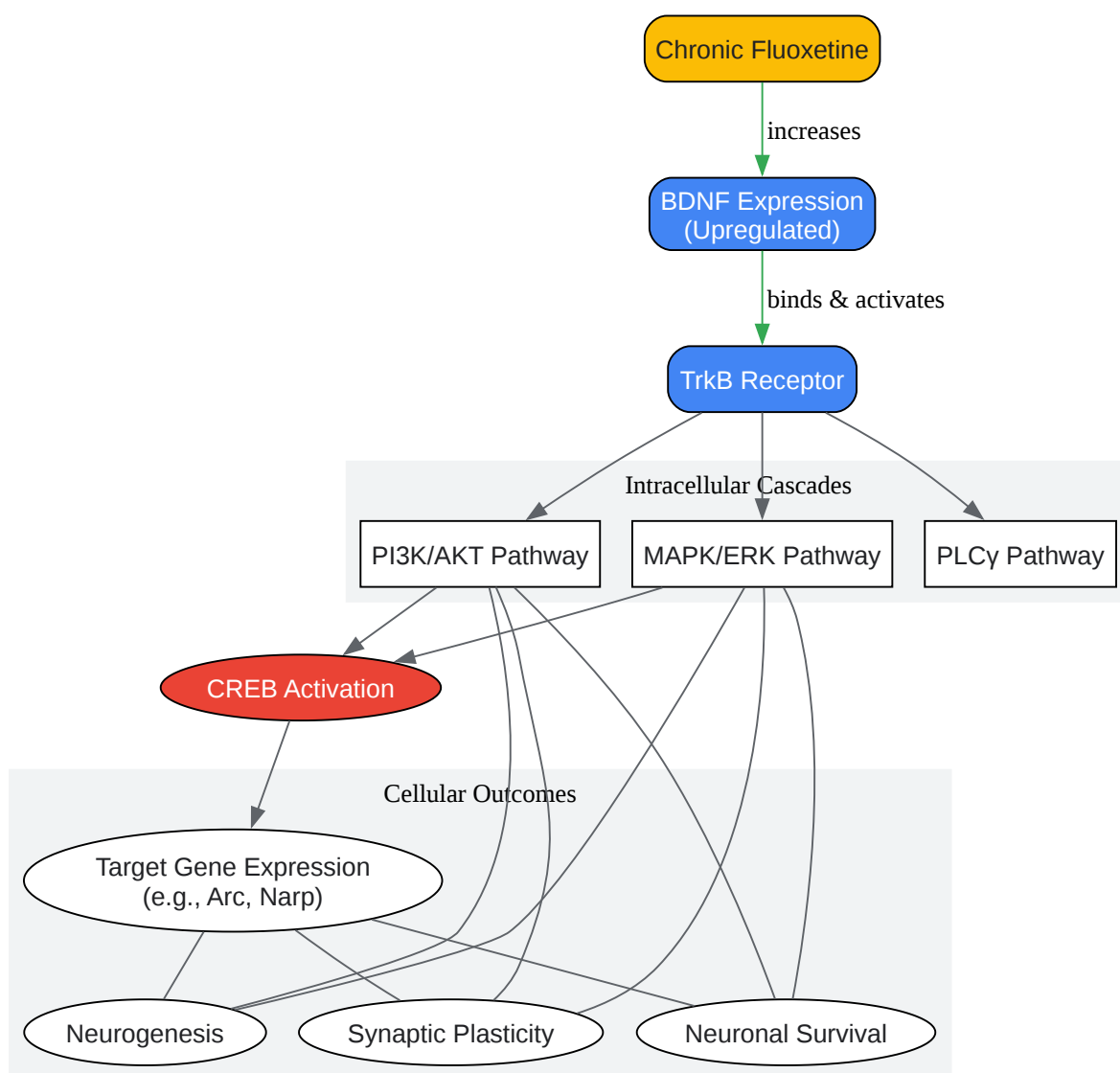
Diagram 2: Fluoxetine-Modulated BDNF-TrkB Signaling Pathway