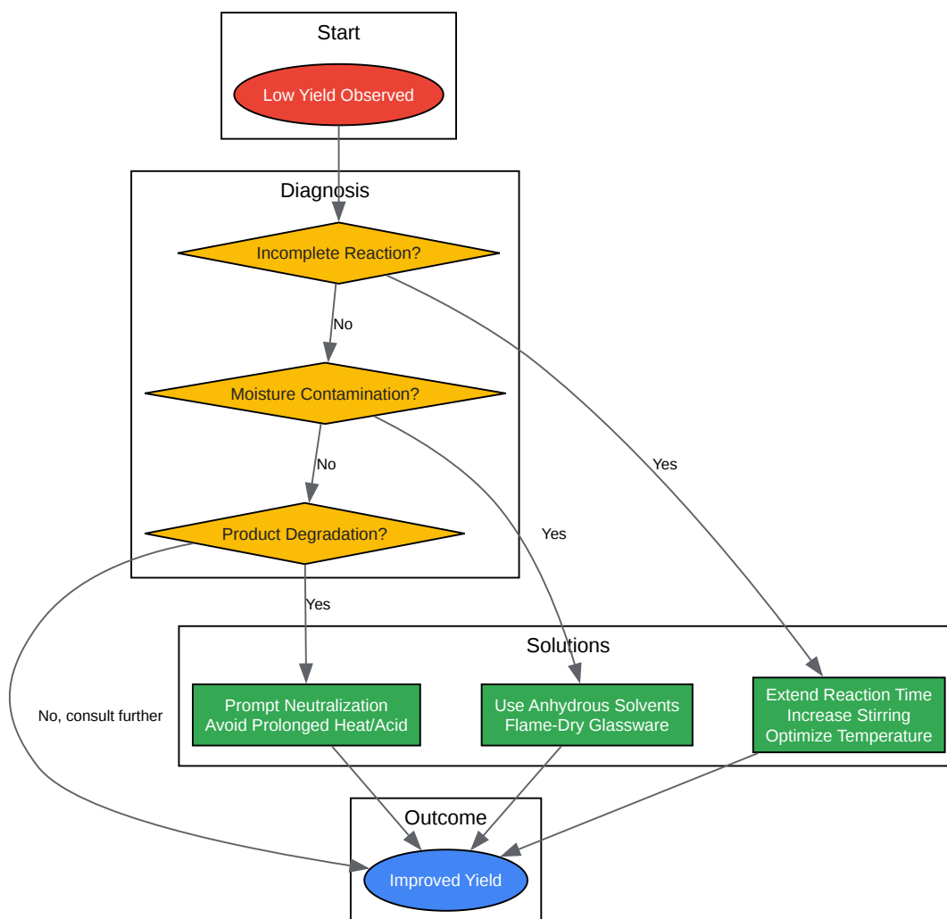
Troubleshooting Low Yield in 2',3'-O-Isopropylideneadenosine Synthesis

Click to download full resolution via product page