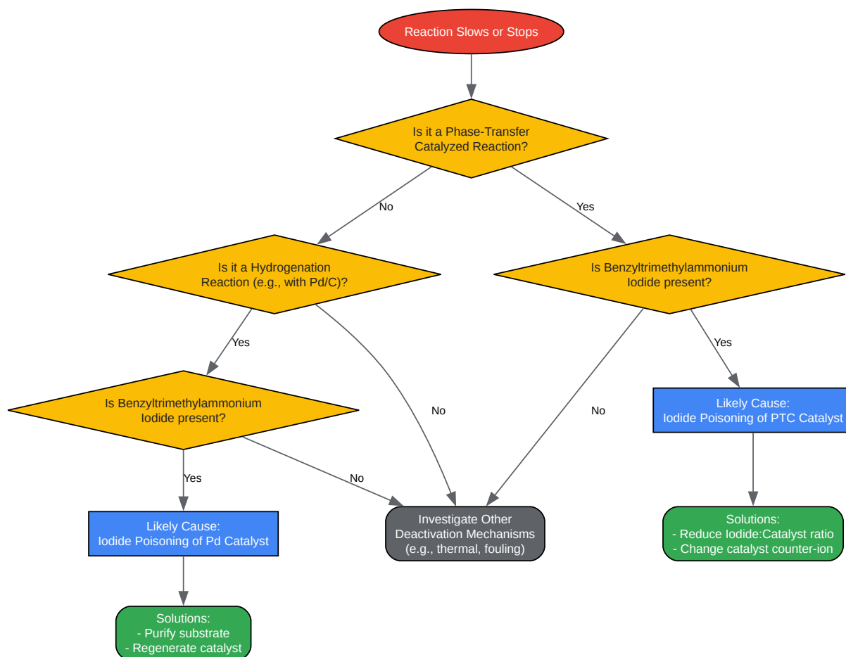
Troubleshooting Logic for Catalyst Deactivation

Click to download full resolution via product page