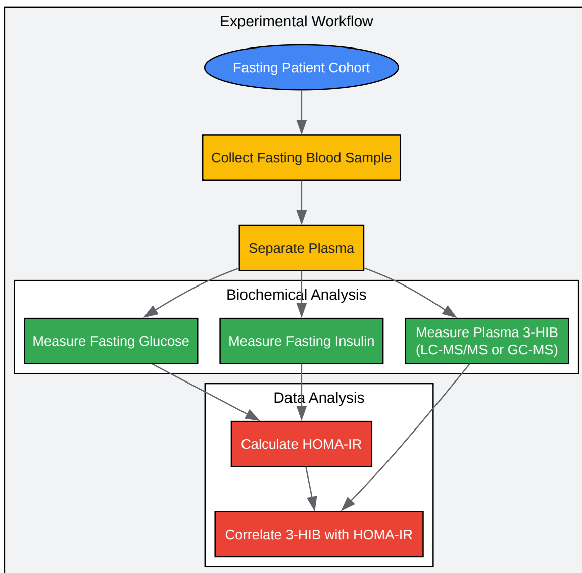
Workflow for Correlating Plasma 3-HIB with HOMA-IR

Click to download full resolution via product page