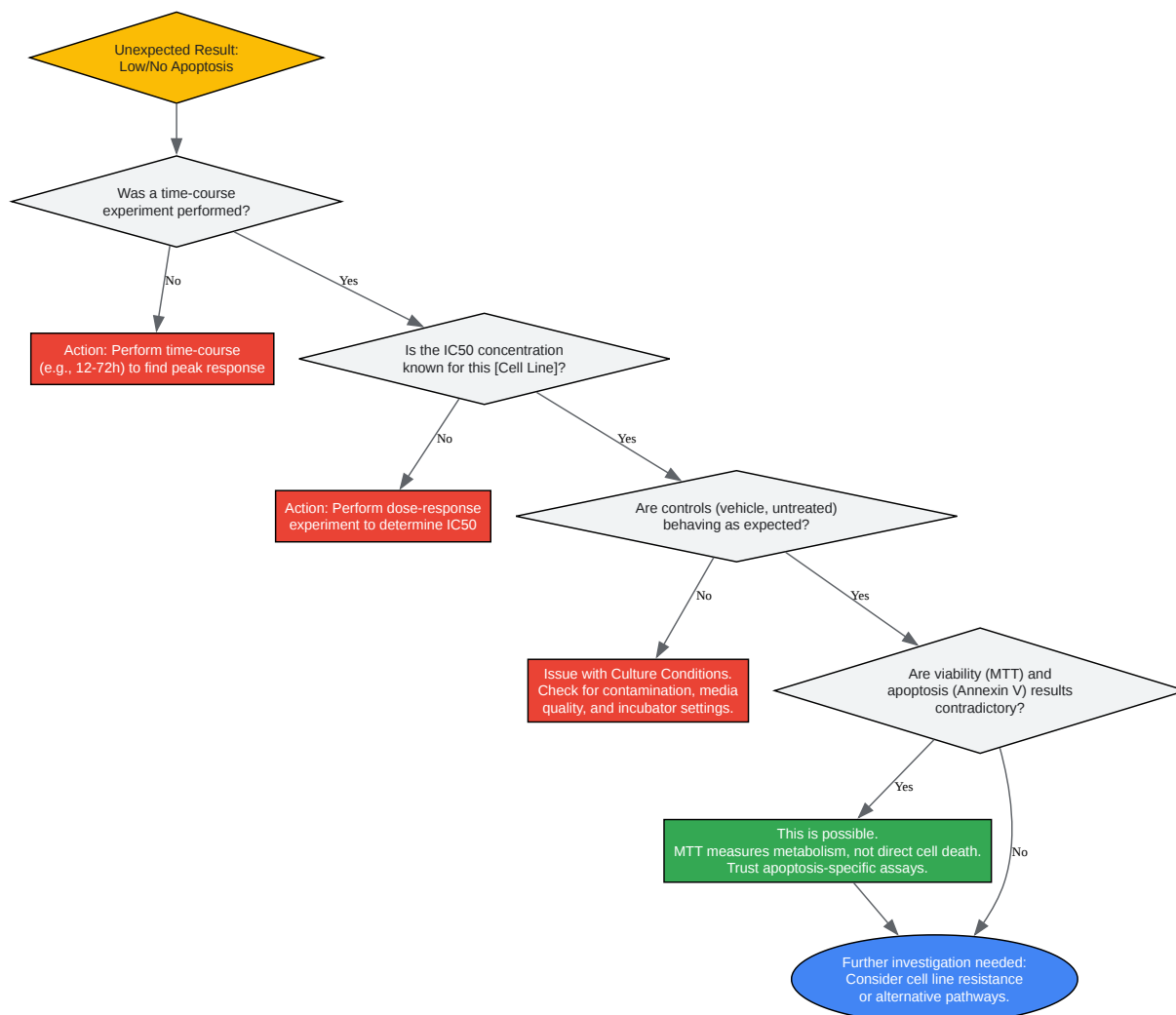
Troubleshooting Unexpected Results

Click to download full resolution via product page