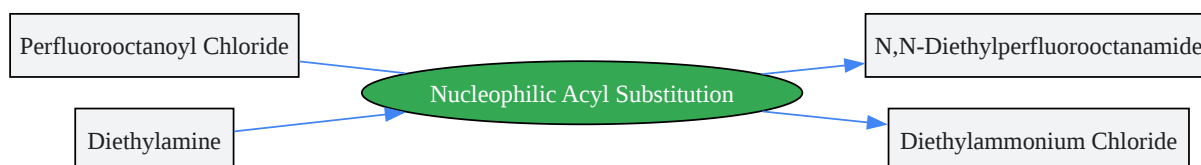
Diagram 3: Amidation of Diethylamine

Click to download full resolution via product page