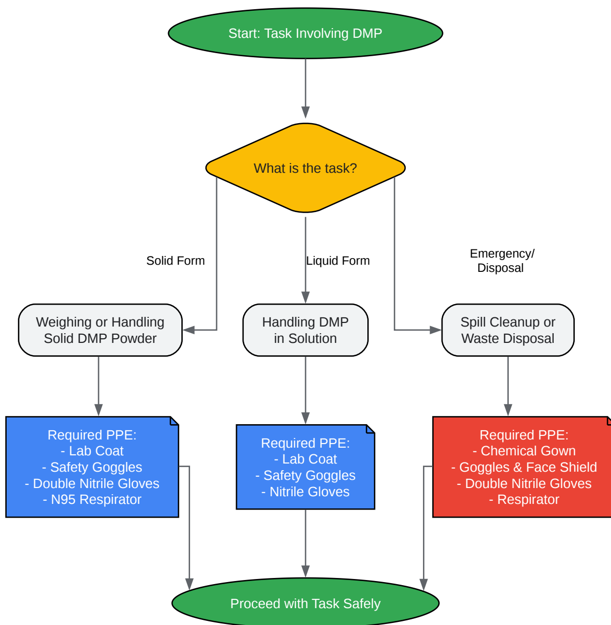
Diagram 1: PPE Selection Logic for DMP Handling

Click to download full resolution via product page