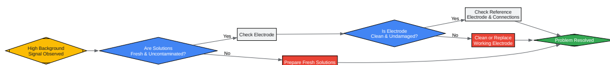
Caption: General Experimental Workflow for Electrochemical Sensing.

Click to download full resolution via product page