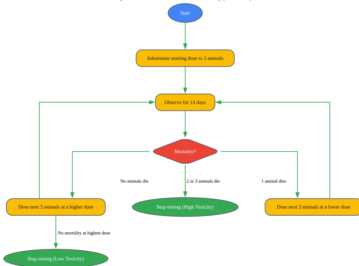
Experimental Workflow for Acute Oral Toxicity (OECD 423)