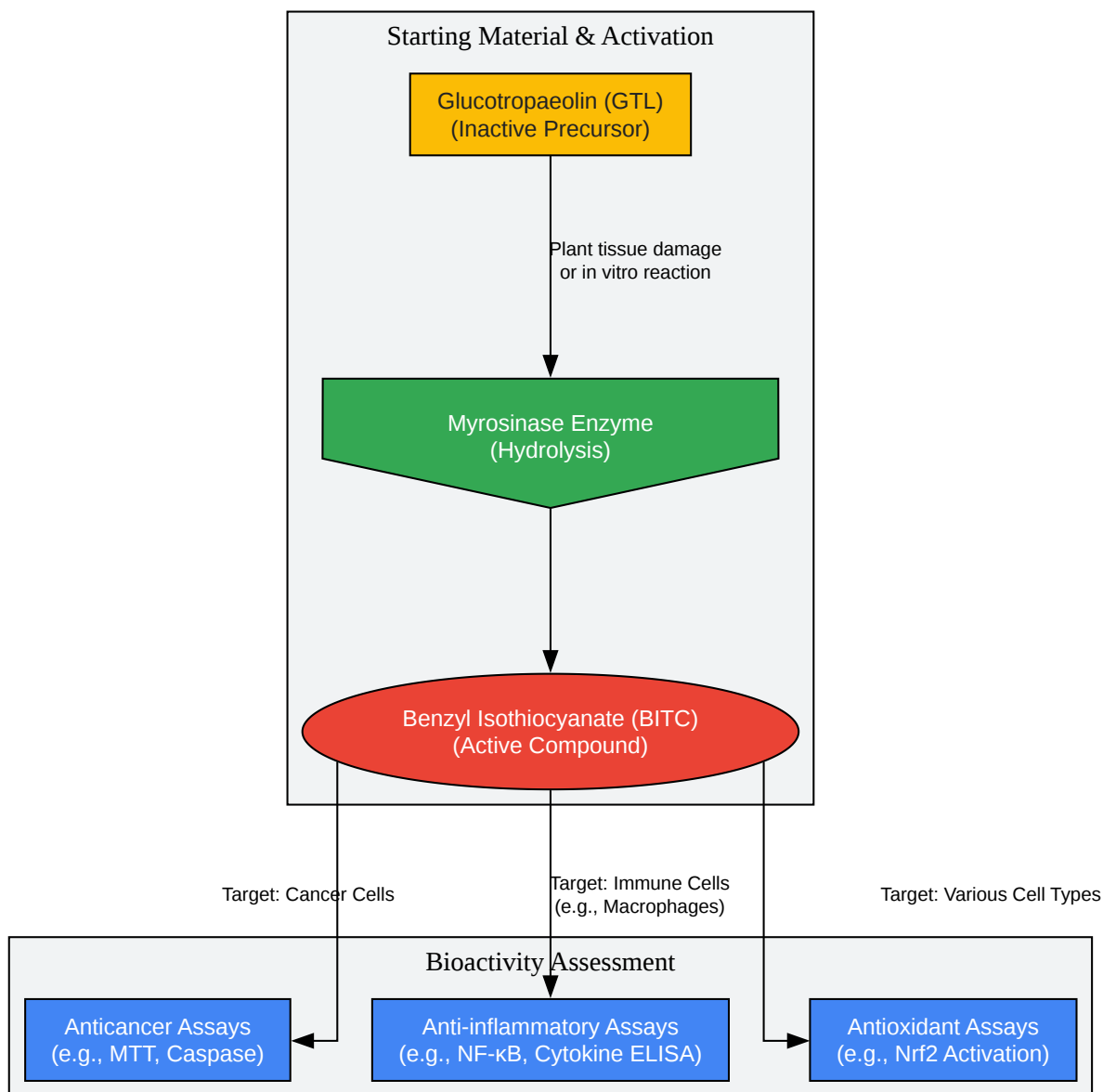
Overall workflow for assessing Glucotropaeolin bioactivity.