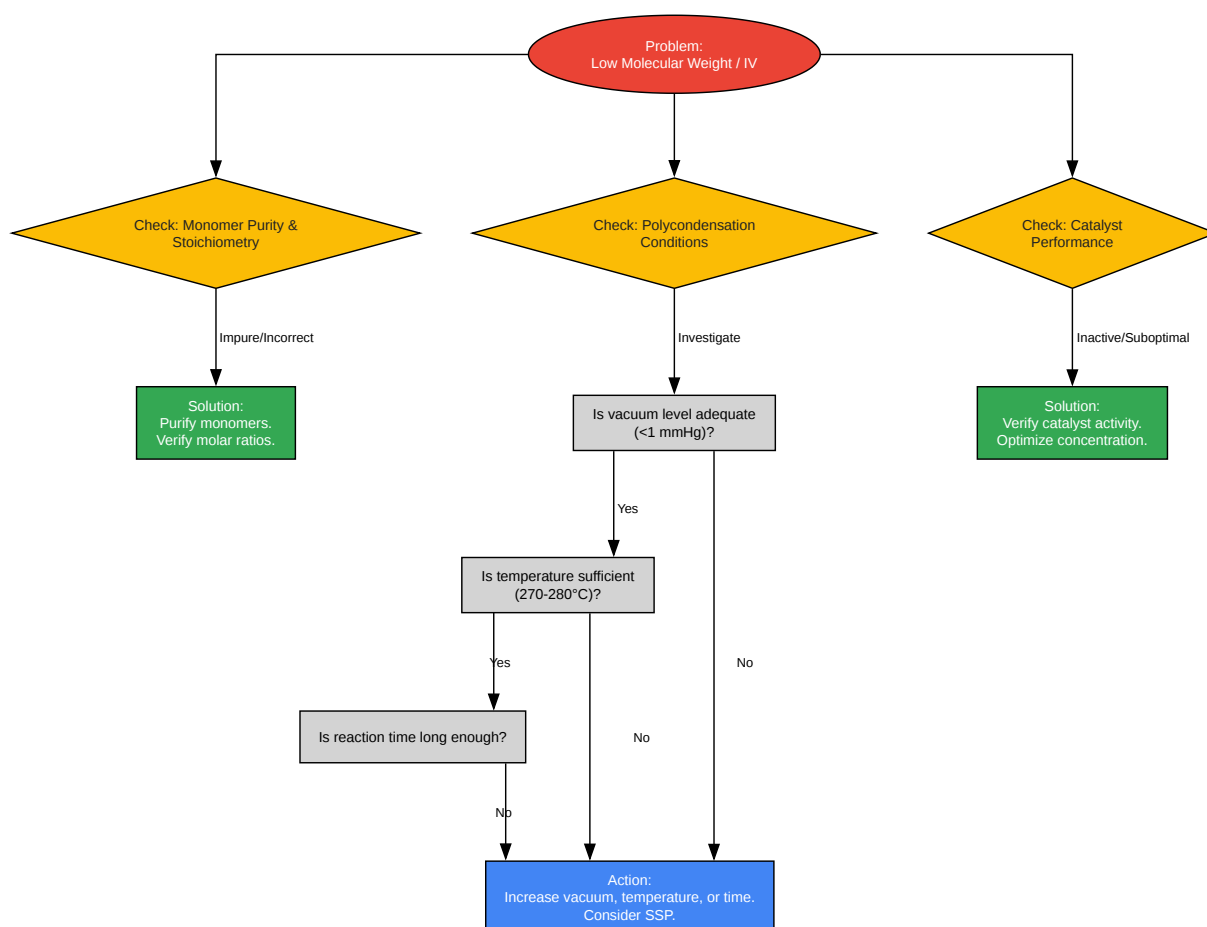
Diagram 2: Troubleshooting Logic for Low Molecular Weight