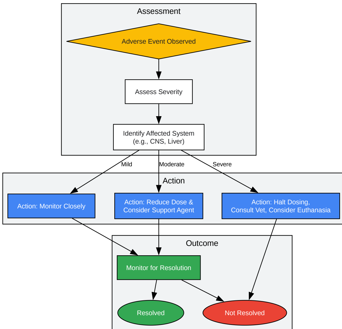
Caption: Workflow for a study evaluating a mitigating agent for drug-induced toxicity.

Click to download full resolution via product page