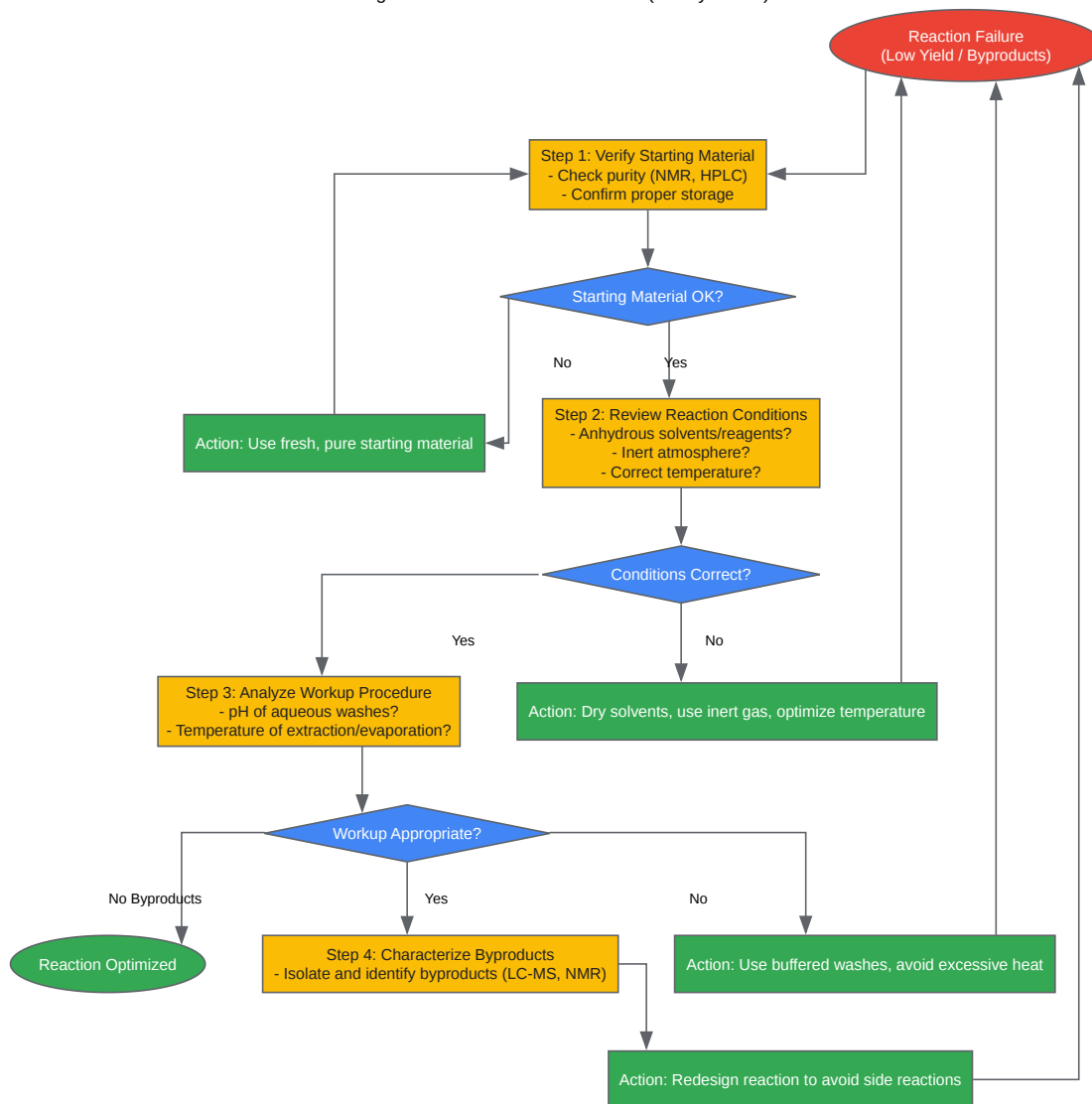
Troubleshooting Workflow for Reactions with 2-(Phenylamino)acetonitrile

Click to download full resolution via product page