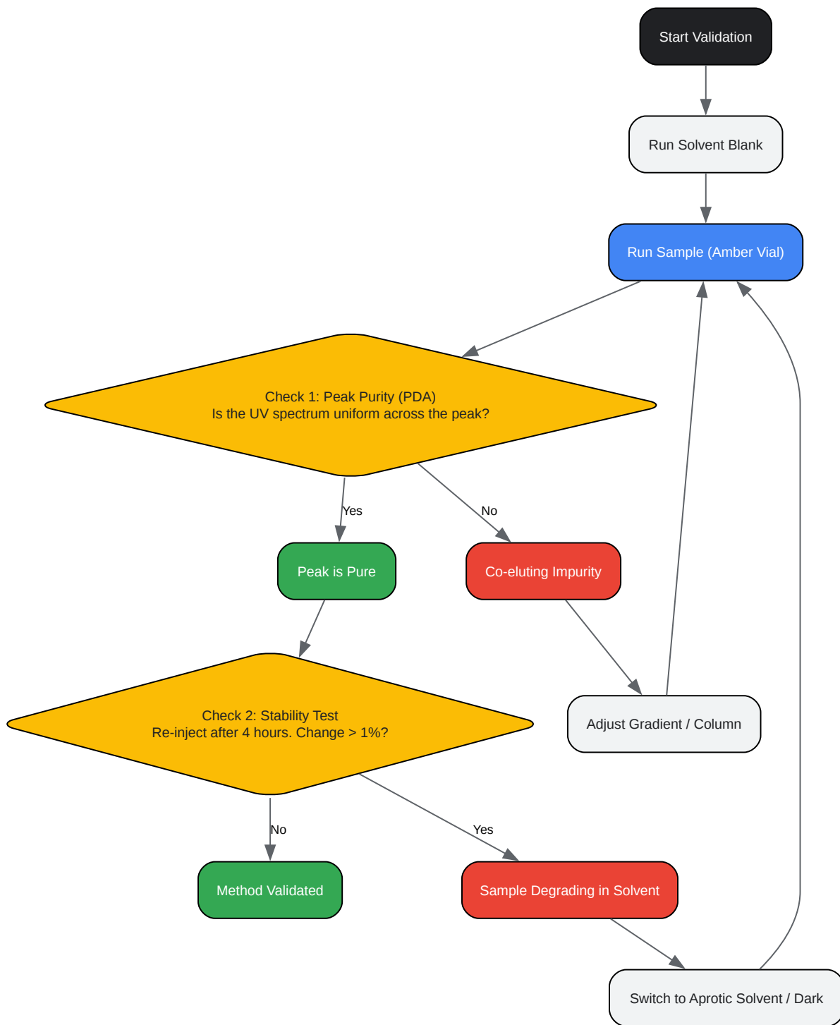
Figure 2: HPLC Method Validation Logic

Click to download full resolution via product page