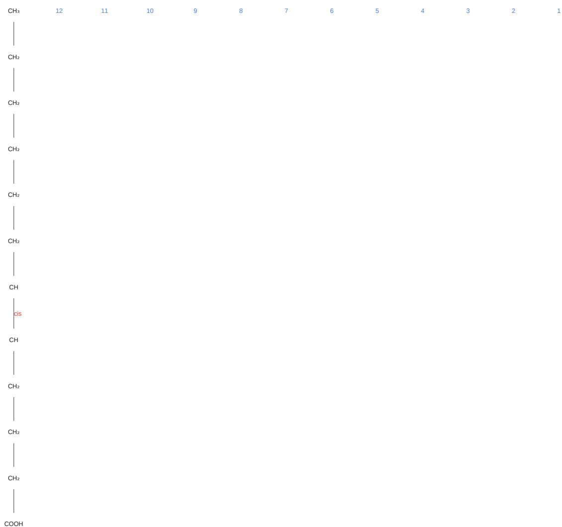
Figure 1: Chemical Structure of cis-5-Dodecenoic acid

Click to download full resolution via product page