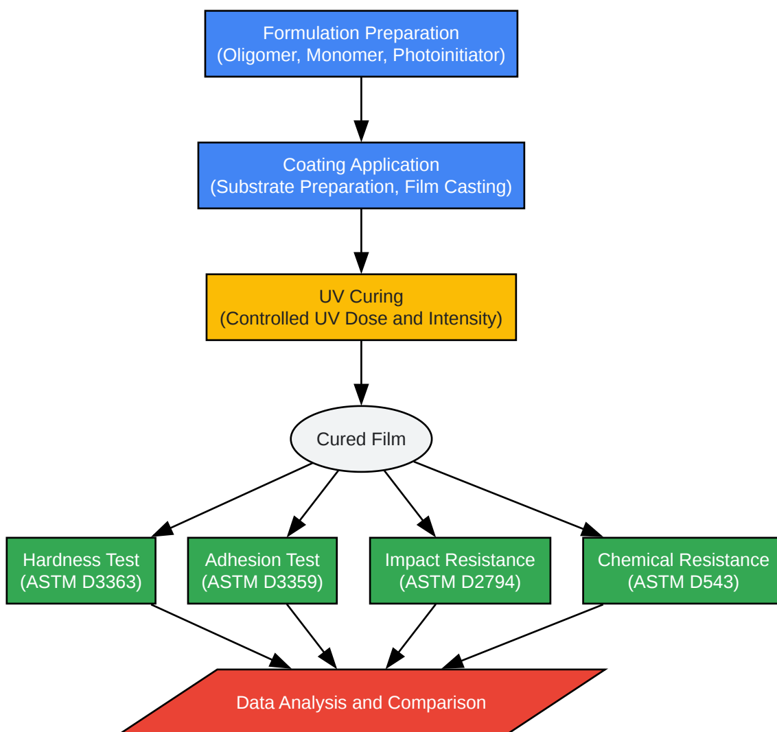
Figure 2. Experimental Workflow for Performance Evaluation.

Experimental Workflow for Performance Evaluation