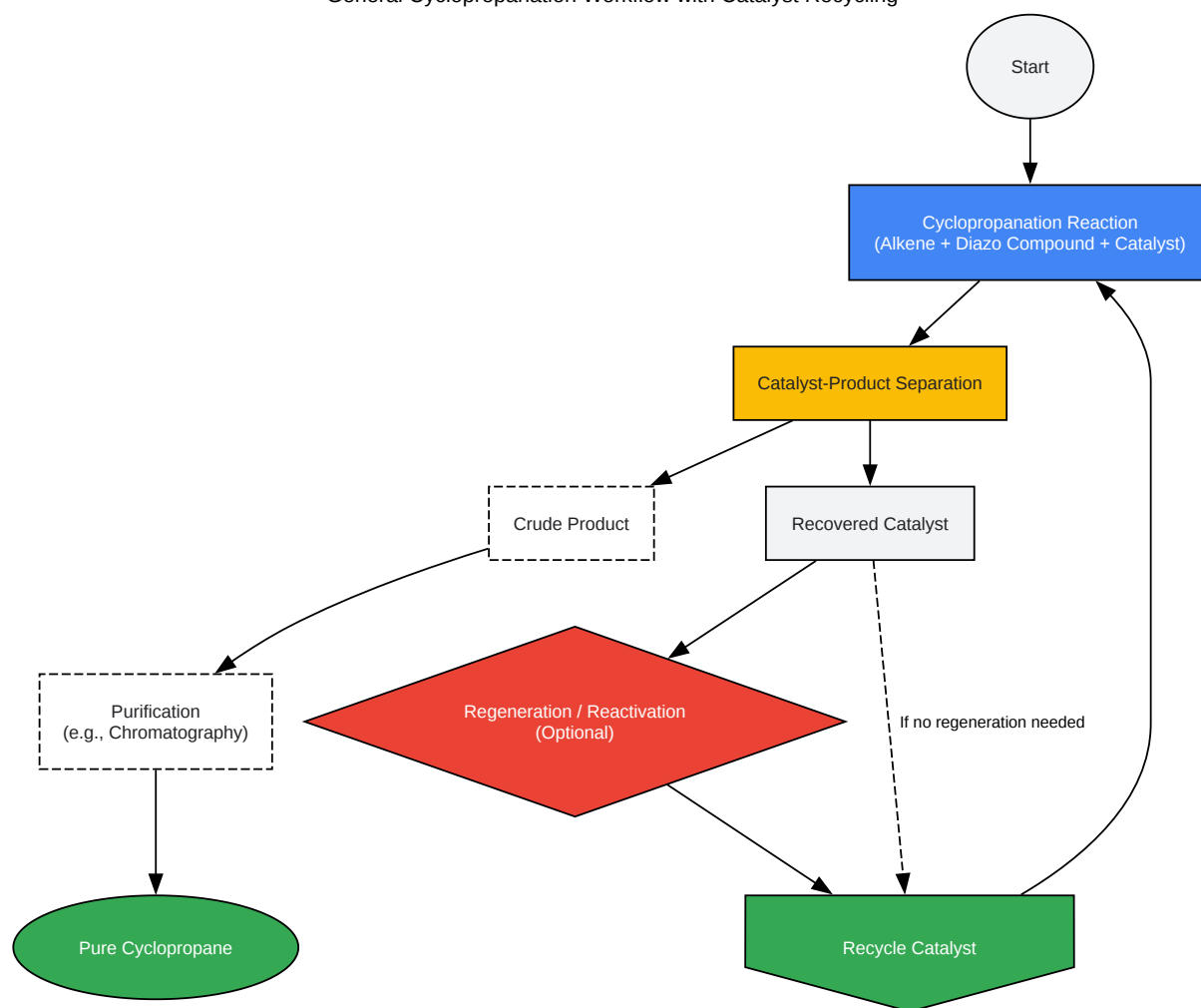
General Cyclopropanation Workflow with Catalyst Recycling

Click to download full resolution via product page