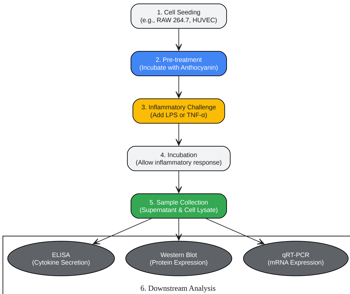
Figure 2: In Vitro Anti-Inflammatory Assay Workflow

Click to download full resolution via product page