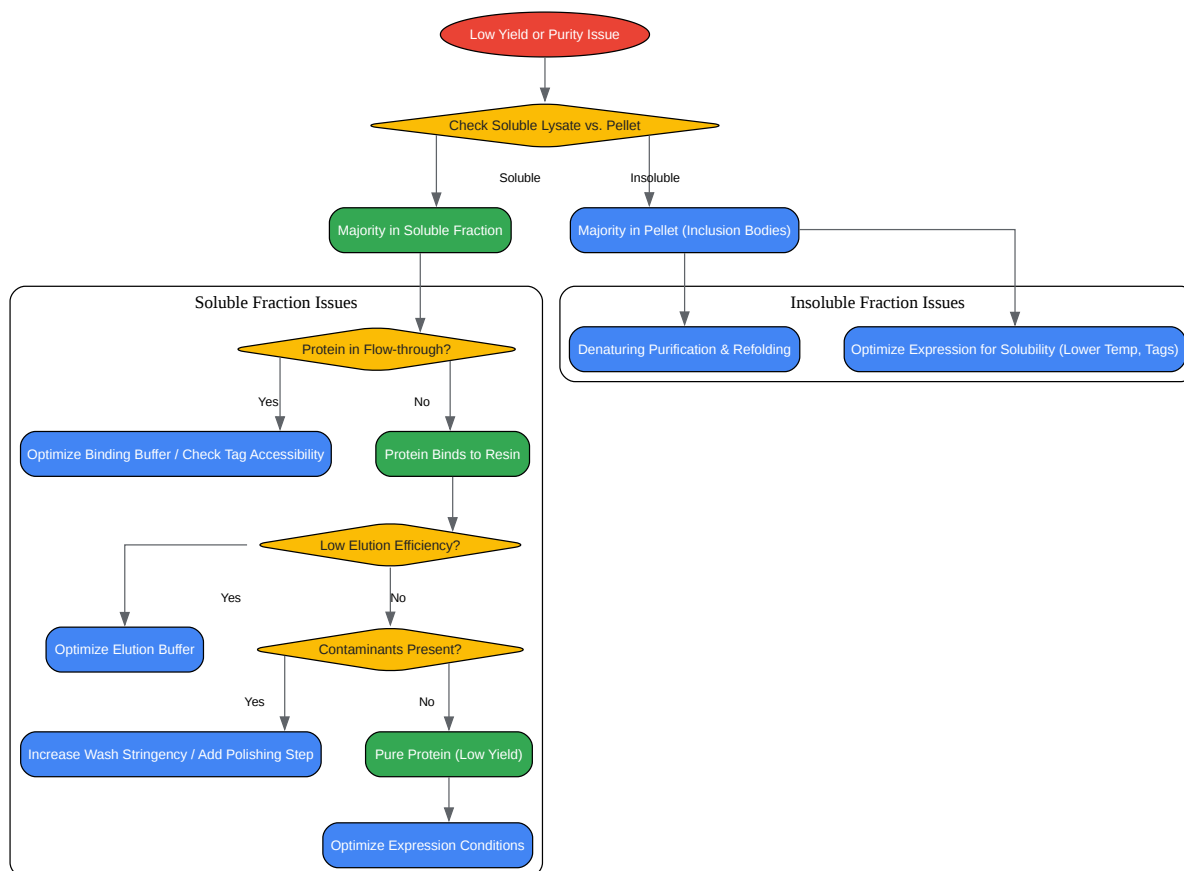
Caption: Workflow for recombinant TUG protein purification.

Click to download full resolution via product page