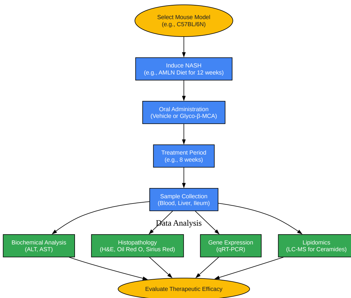
Diagram 2: Experimental Workflow for Evaluating Glyco- \beta -MCA in a NASH Mouse Model

Click to download full resolution via product page