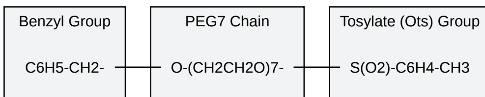
Figure 1. Chemical Structure of Benzyl-PEG7-Ots

Click to download full resolution via product page