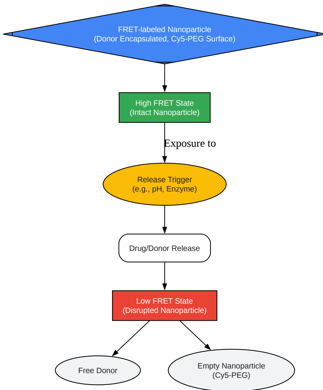
Caption: Workflow for Protein-Protein Interaction FRET Assay.

Click to download full resolution via product page