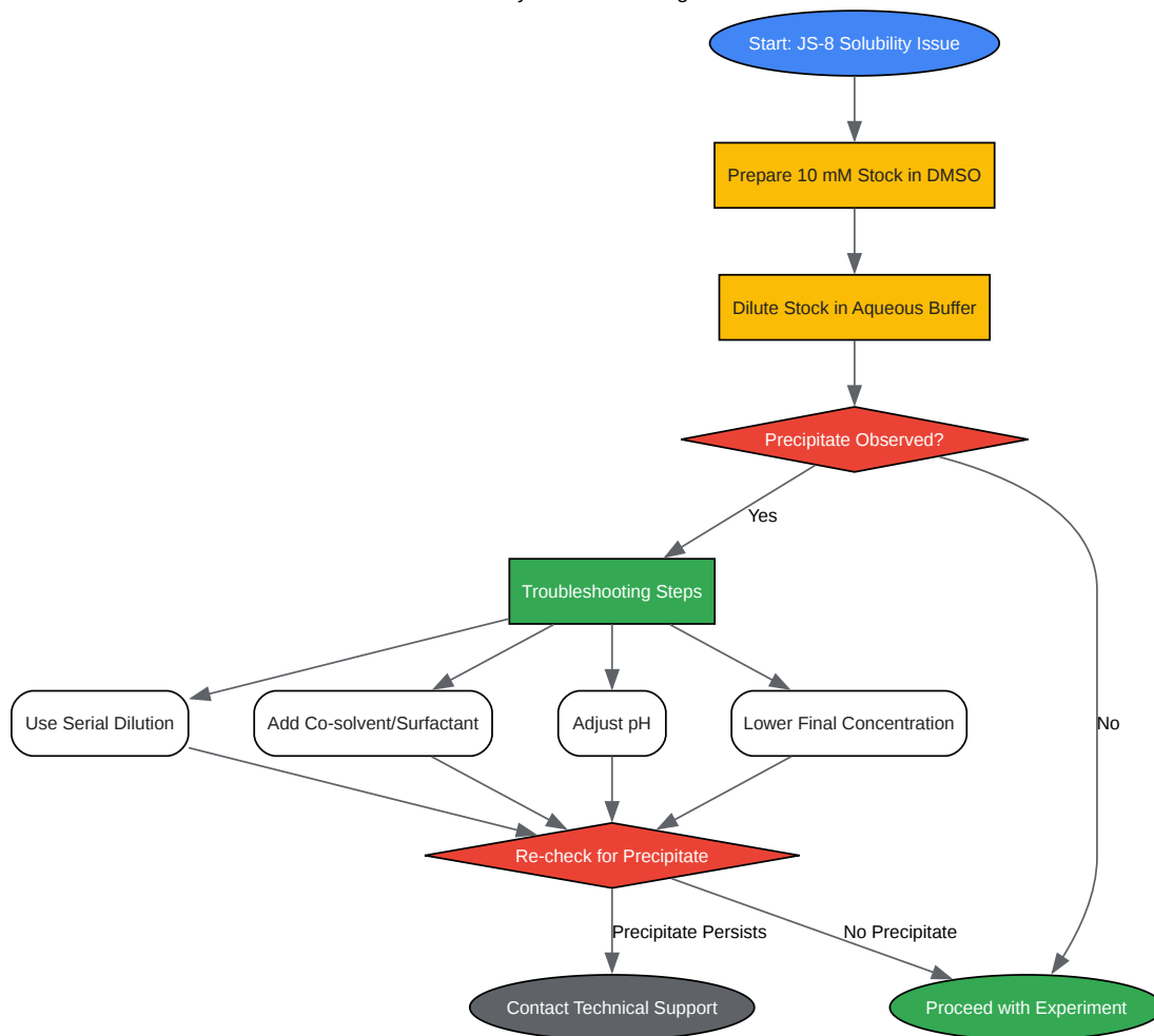
JS-8 Solubility Troubleshooting Workflow

Click to download full resolution via product page