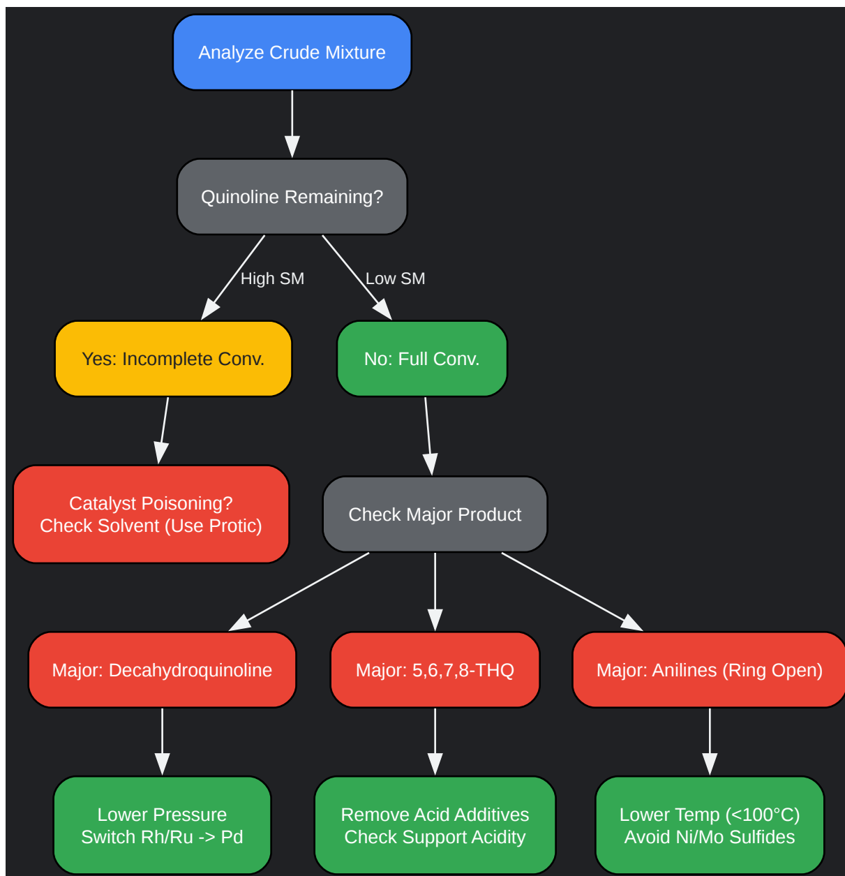
Figure 2: Troubleshooting Logic Tree

Click to download full resolution via product page