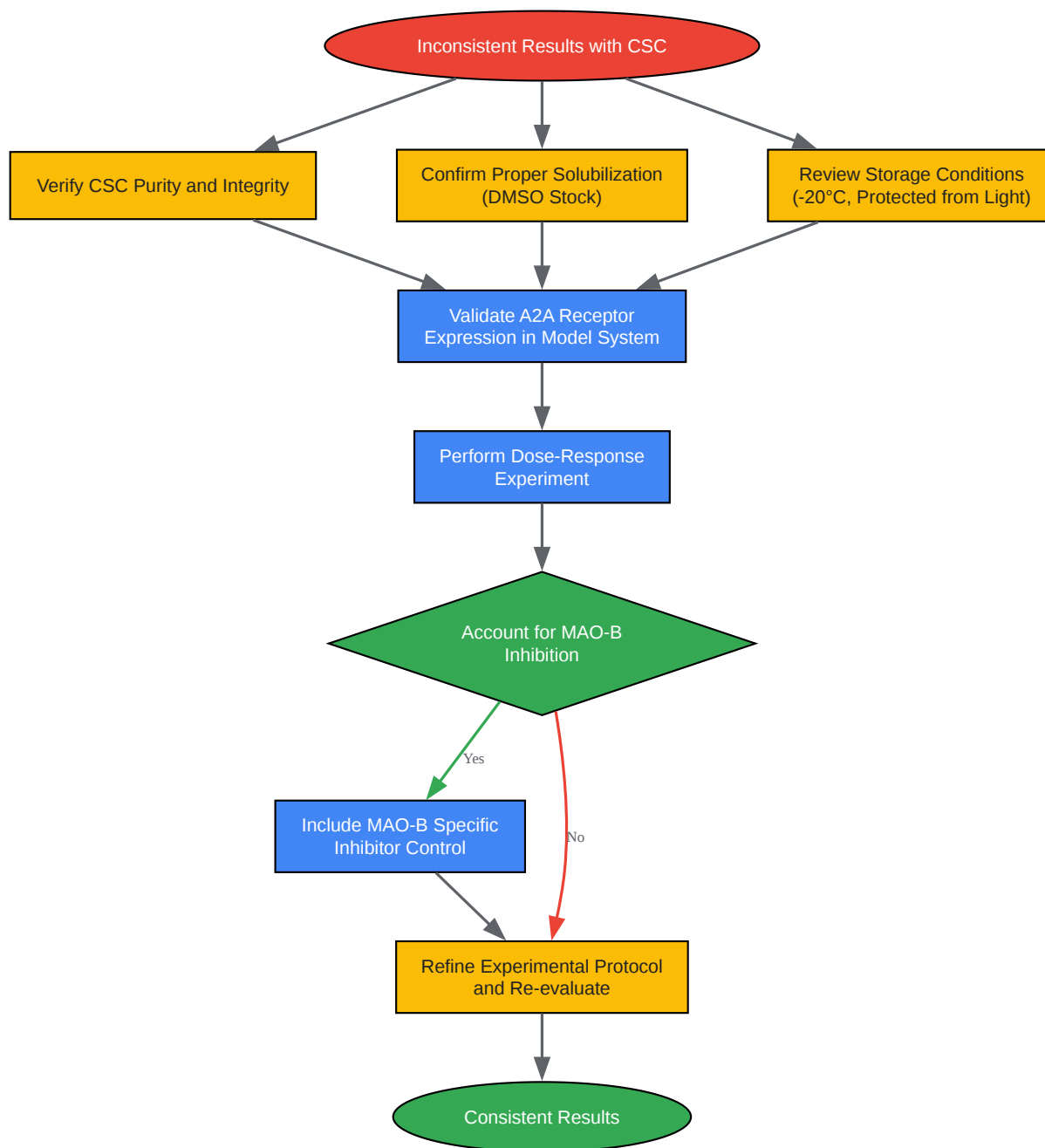
Caption: A2A Adenosine Receptor Signaling Pathway.

Click to download full resolution via product page