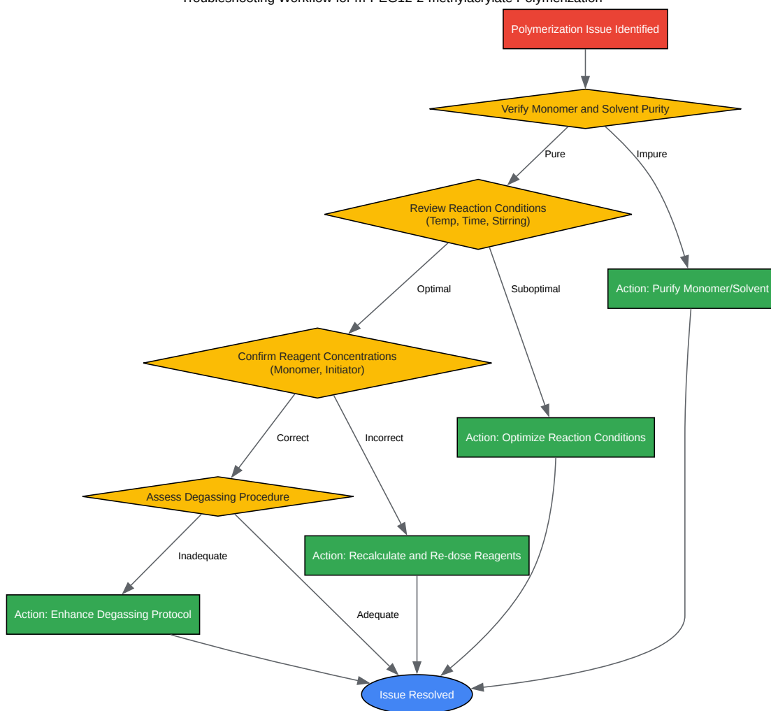
Troubleshooting Workflow for m-PEG12-2-methylacrylate Polymerization

Click to download full resolution via product page