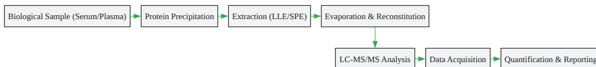
Caption: Simplified metabolic pathway of Vitamin D3.

Click to download full resolution via product page