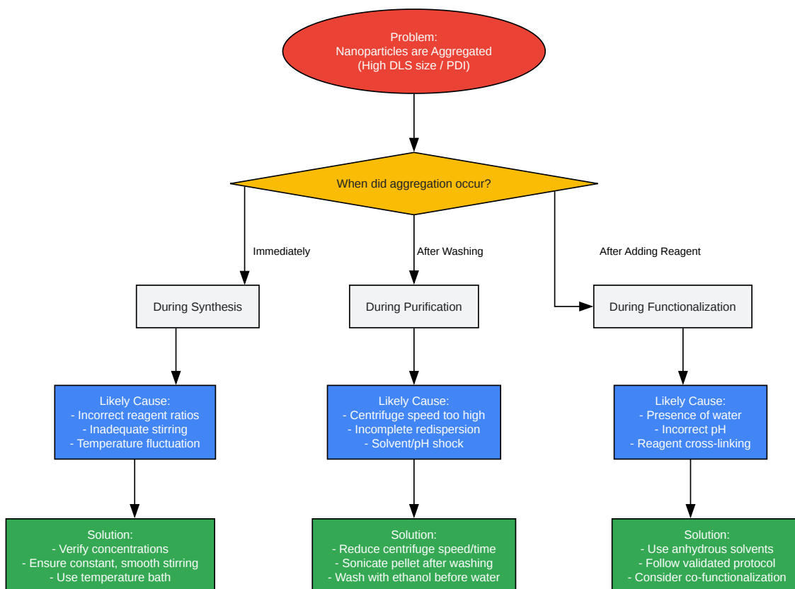
Fig 2. Troubleshooting Nanoparticle Agglomeration

Click to download full resolution via product page