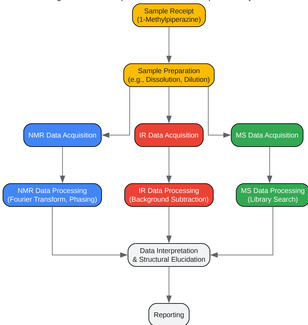
Figure 2. General Experimental Workflow for Spectral Analysis

Click to download full resolution via product page