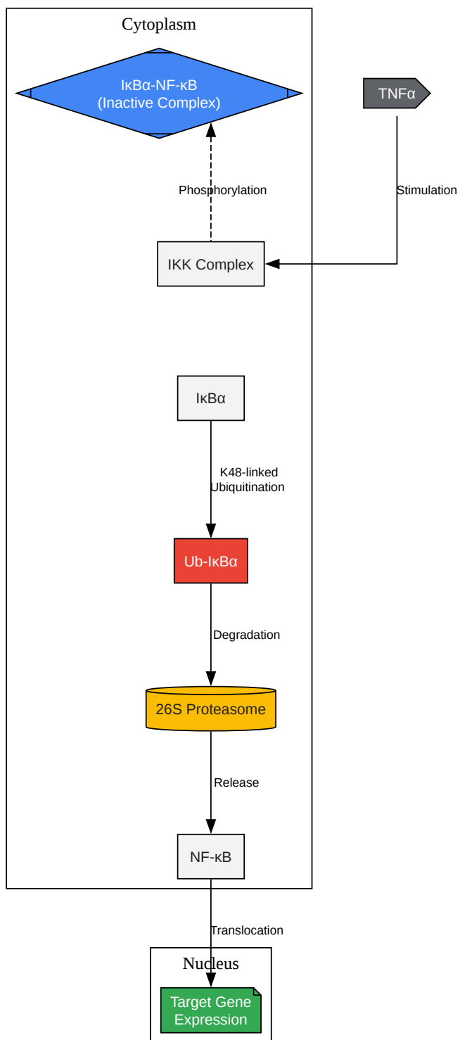
Figure 3. Role of ubiquitination in NF-κB signaling.

Click to download full resolution via product page