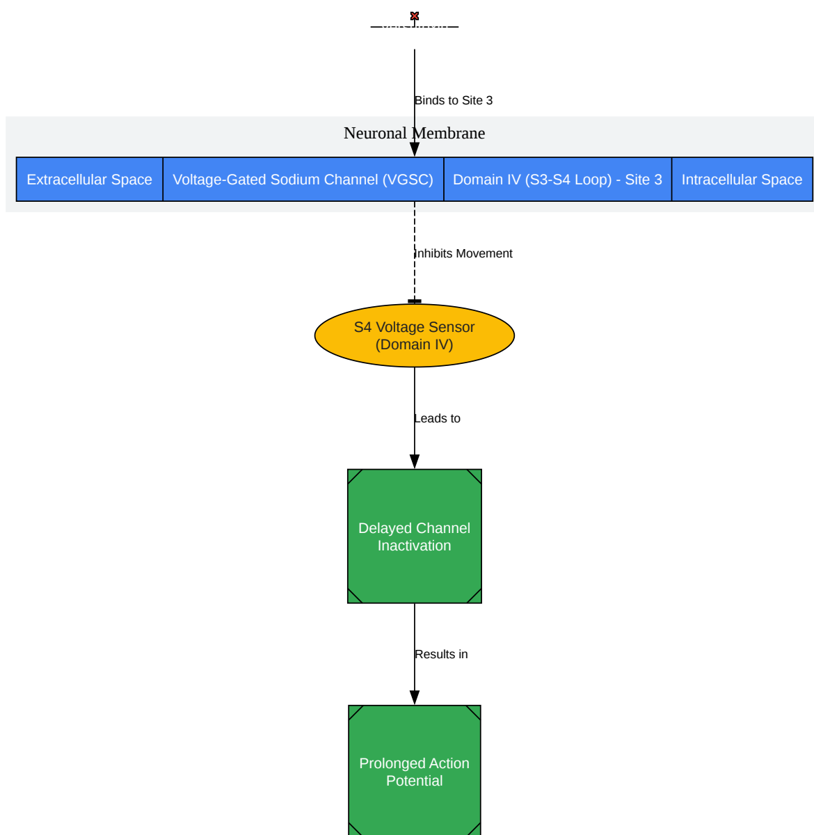
Figure 1. Experimental workflow for the purification of versutoxin .

Click to download full resolution via product page