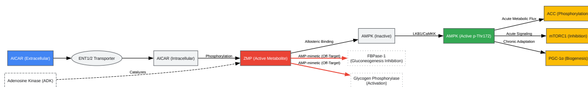
Diagram 1: AICAR Mechanism and Off-Target Pathways

Click to download full resolution via product page