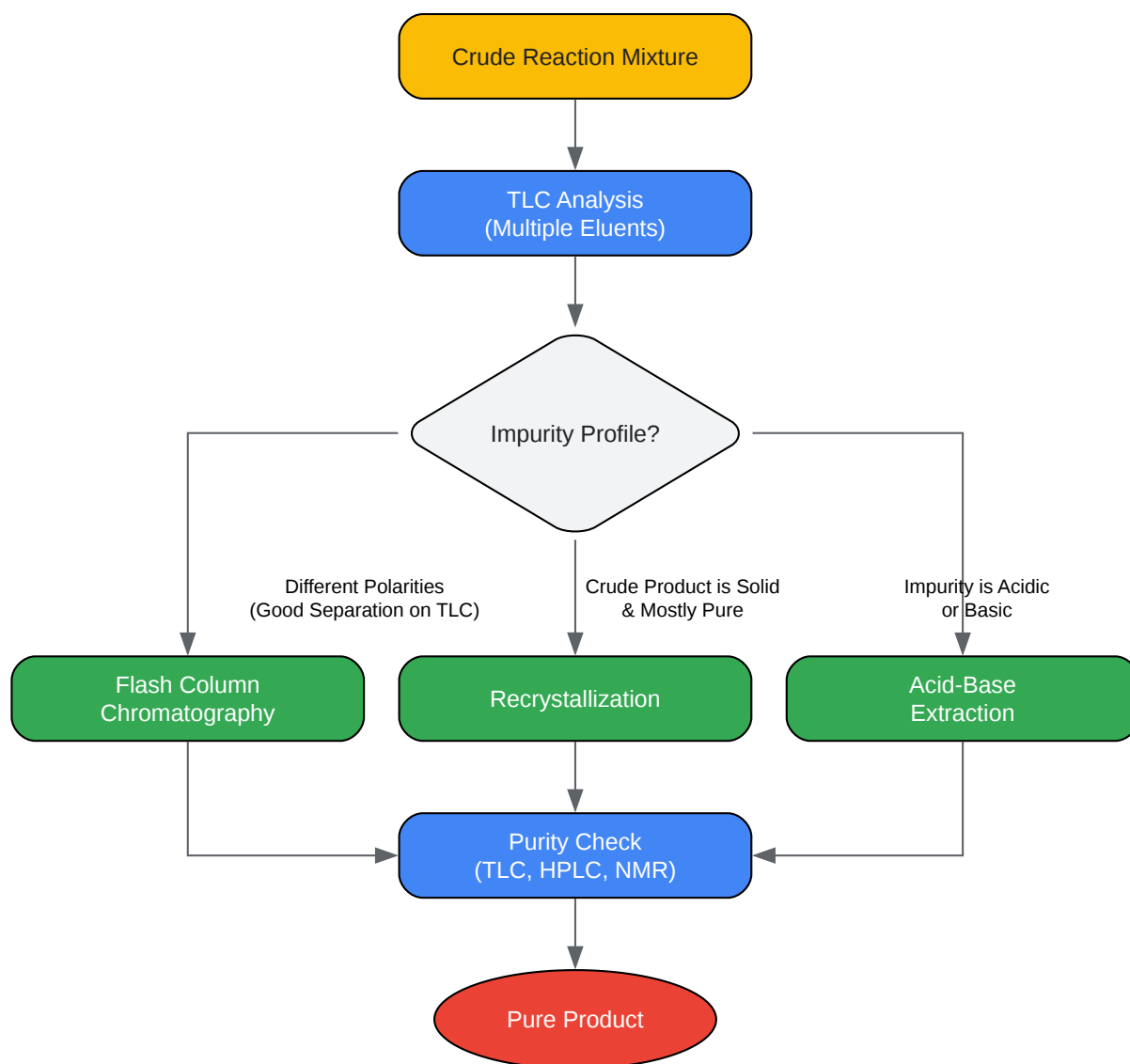
General Purification Workflow for Brominated Pyrimidines

Click to download full resolution via product page