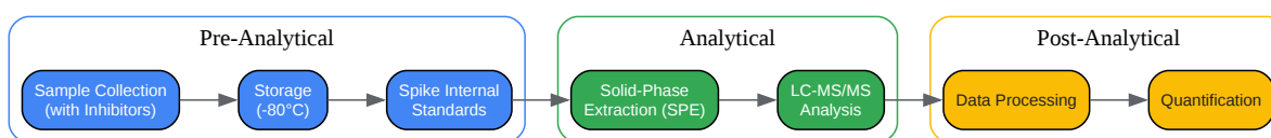
Diagram 1: General Workflow for Eicosanoid Quantification

Click to download full resolution via product page