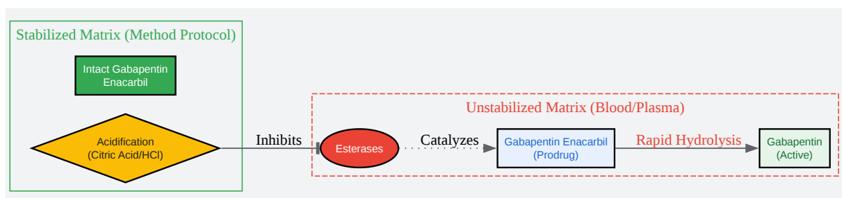
Figure 1: Hydrolysis Pathway & Stabilization Strategy

Click to download full resolution via product page