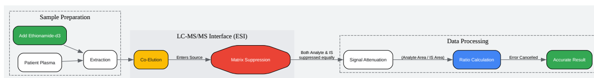
Diagram 1: The Mechanism of Stable Isotope Correction

Click to download full resolution via product page