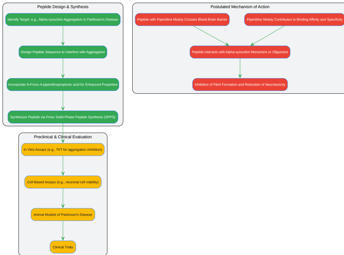
Logical Workflow for N-Fmoc-4-piperidinepropionic Acid in Neurological Drug Design

Click to download full resolution via product page