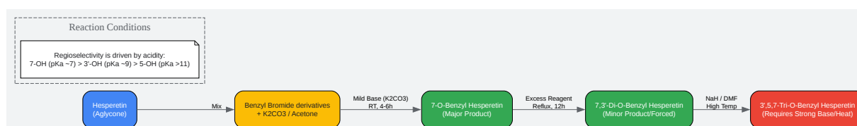
Diagram 1: Synthesis Workflow of O-Benzyl Hesperetin Derivatives

Click to download full resolution via product page